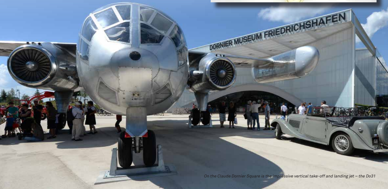
On the Claude Dornier Square is the impressive vertical take-off and landing jet – the Do31